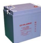
12V 150A Battery x3pcs