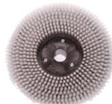
16"/19"Brush PP 0.28