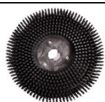
16"Brush x2pcs(T150/85R) 19"Brush x2pcs(T150/100R)