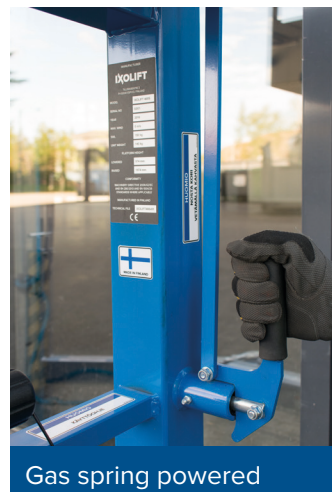
Gas spring powered